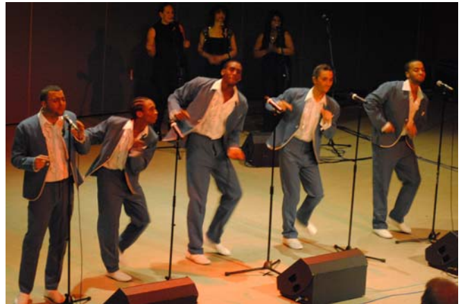
The cast of The Classic Motown Show, performing as "The Temptations"

For more information on any Liverpool Lighthouse projects or events, visit our website at