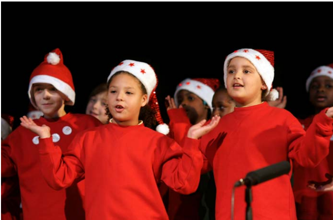
The Heart of Christmas featured children from the local community

We would like to thank everybody who's taken part in our events over the past few months; whether you were performing on the stage or working behind the scenes, we couldn't have had such a successful season without each and every one of you!